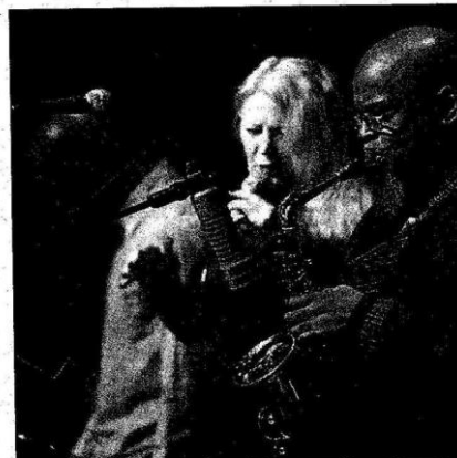
ACE Collective begeisterte in Linz.